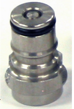
Turret Ball Lock for Liquid 9/16" UNF Thread (female)