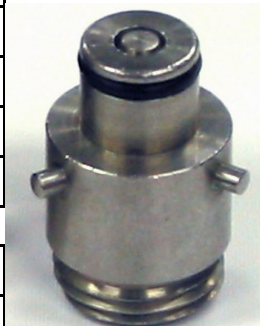
Turret Bayonet Plug for Liquid with 1/2" BSP Thread (Male)