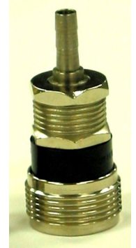
Turret Ball-Lock Liquid Socket with 6mm Inline Hose Tail.