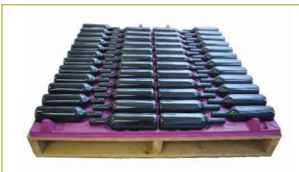
CS48 – 48 bottles per tray – pallet footprint 1175 mm 2