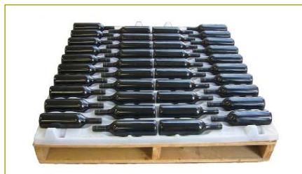
CS40 – 40 bottles per tray – pallet footprint 1175 mm 2 for sparkling and super premium bottles