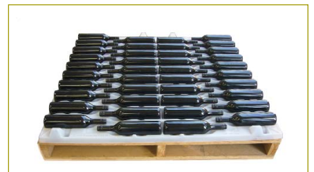
CSE40 – 40 bottles per tray – pallet footprint 1200 x 1000 mm

Distributed by: Vitis (NZ) Ltd 52 Grove Rd Blenheim 03 578 778 sales@vitis.co.nz www.vitis.co.nz